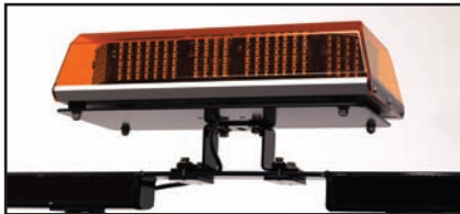
Optional mounting plate #98012 with C-bracket 98014 and 2 clamp kits 98009

AVAILABLE IN LOW AND HIGH PROFILE CONFIGURATIONS!