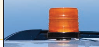
27021 - Magnet Mount

Note: Dimming feature indicates photocell with automatic night time operation