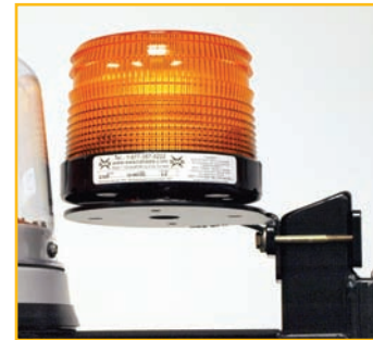
27026 shown on optional bracket 98007 with clamp 98009