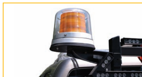
22601 on optional mounting bracket 98005