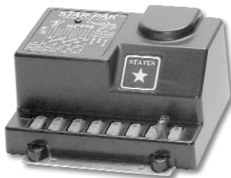
✱ RP966 & RP996

Size 2"H x 5-1/2"L x 4-1/4"D Weight 1.5 Lbs Watts 75 Amps 7 amps max Voltage 12-24 Vdc Outlets 4 Features LED visual diagnostic indicators